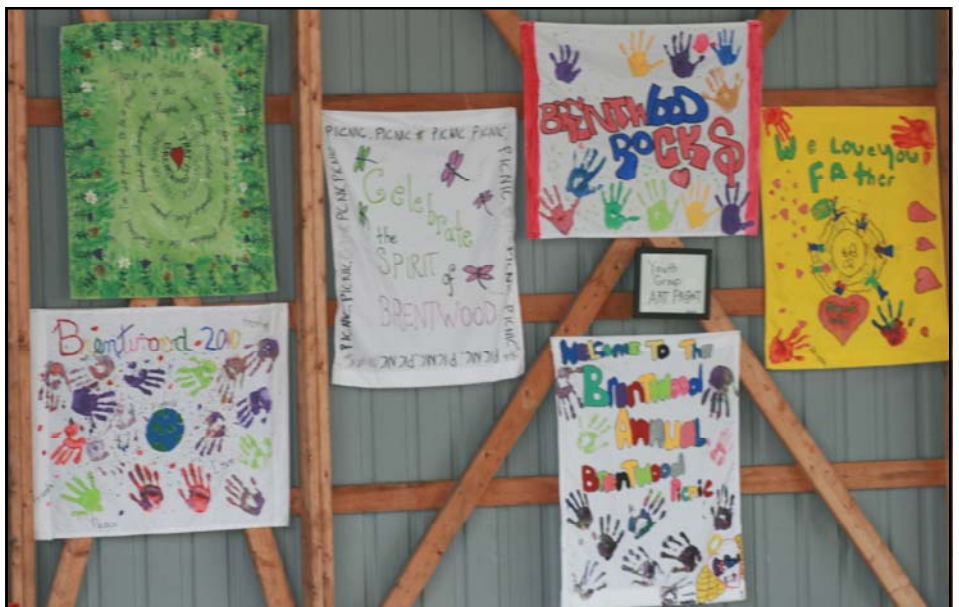
Youth Group Banners on display at the picnic

YOUTH GROUP MEETINGS TUESDAY @ 6PM AGES 6-16