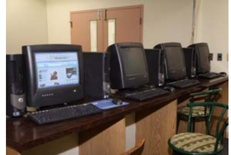
Youth group computer lab

The Youth Group has always relied on volunteer help. In the earlier years, program people would be assigned to help run the meetings, but currently alumni volunteers are supporting the program. And, as true to the spirit of Brentwood, it is the volunteers that certainly make the program possible. The current edition of the Youth Group's attendance varies between 20 and 30 members, and is supported by 16 volunteers on any given Tuesday. Connie and Rob have witnessed some inspiring moments during their